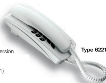
Type 6221 + 6140

Technical notes: 2 metres of cable with 6 wires , fixed terminal block